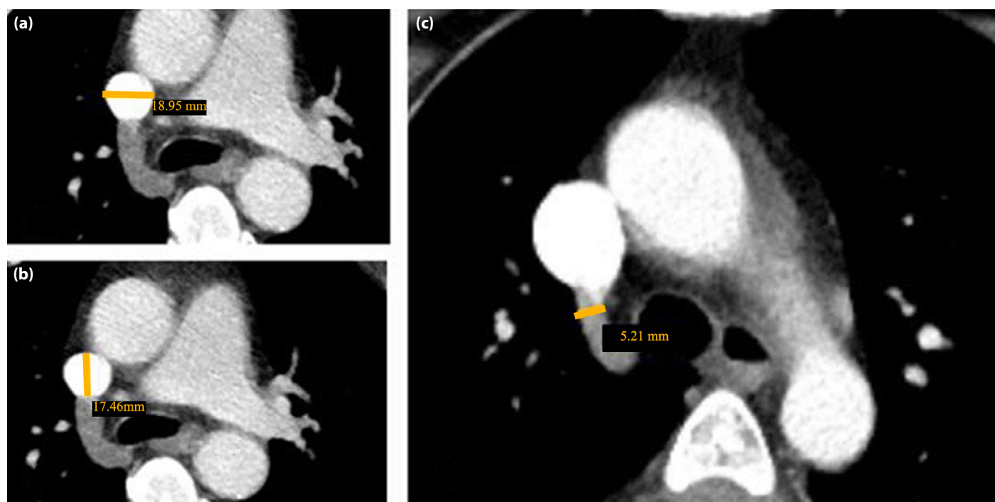
Figure 1. (a–c) Measurement of vein diameters. (a) Transverse diameter of the superior vena cava. (b) Anteroposterior diameter of the superior vena cava. (c) Diameter of the azygos vein.

This study was approved by the local ethics committee of Selçuk University Faculty of Medicine (approval date: 21/04/2021, approval number: 2021/212). CT images obtained at the Department of Radiology of Selçuk University were retrospectively analyzed. Patients with a history of thoracic surgery, pulmonary masses, or acute coronary disease were