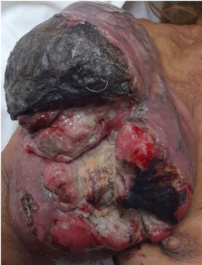
Figure 1. Clinical image of giant dermatofibrosarcoma protuberans located on the right arm

cal margins (Fig. 3). The postsurgical course was favorable and the patient was discharged on the third postoperative day and followed up in the outpatient clinic. The patient was also followed up by the medical oncology team, who elected to pursue a surveillance regime based on the tumor-free surgical margins. One year after surgery, there had been no recurrence.