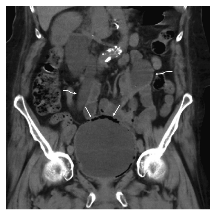
Figure 2. Computed tomography image showing diffuse intramural gas (thin arrows) and bilateral hydroureteronephrosis (curved arrows)

Conflict of Interest: There is no conflict of interest in this study.