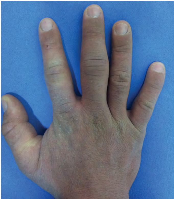
Figure 1. Metacarpophalangeal (MCP) and Proximal interphalangeal (PIP) joint swelling

(A.CCP): <0.5 U/mL, C-reactive protein (Crp): 4.3 mg/L, Anti-nuclear antibody (ANA): negative. In our case, rheumatoid arthritis and other rheumatological diseases were not detected. No other etiologic cause could be detected, so arthritis due to acitretin was considered, and treatment was discontinued. Naproxen sodium 750 mg/day and 16 mg systemic prednisolone were started. The systemic prednisolone was reduced and discontinued within one month. The patient's complaints ceased almost completely within 2–3 months. The case's follow-up continues. Informed consent was obtained from the patient for the publication of this case report and images.