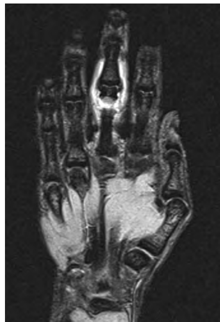
Figure 3. Synovial hypertrophy and effusion were present in the hand MRI

ingly, in our case, arthritis was only present in the hand joints.