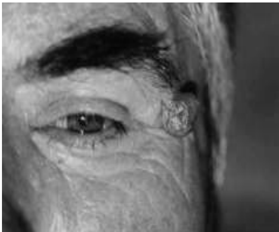
Fig. 1: View of lesion on lateral eyebrow.

Therefore, the principal treatment of eccrine poromas should be excision and a correct histopathological diagnosis. When these situations are considered, although it is clinically a rare condition, it is important to consider eccrine poroma in differential diagnosis of head and neck tumors.