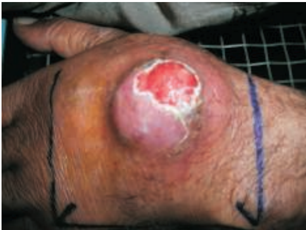
Picture 3. The lesion on dorsum of hand.