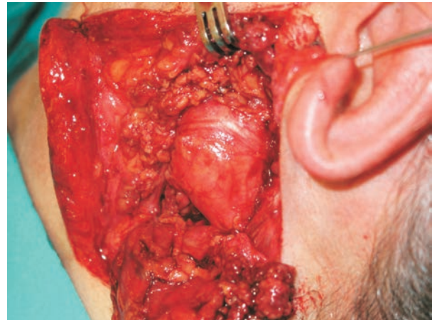
Picture 1. Enlarged deep lobe of the left parotid gland with an intact facial nerve.

multiple nodules of large polyhedral cells with intensely eosinophilic granular cytoplasm and centrally placed pyknotic nucleus arranged in tubuloacinar structures were identified (Picture 2). There were sebaceous metaplasias in some ducts. The cystic spaces were lined by oncocytic cells. The residual parotid gland showed scattered dilated ducts containing intraluminal calculi and rare foci of mild chronic inflammatory infiltrates with a predominantly periductular distribution. In other areas acinar atrophy, and stromal fibrosis were seen. No necrosis, mitotic activity, cellular atypia or invasion was identified. Immunohistochemically the oncocytes were diffusely positive for CK7 (Picture 3) and ductal epithelium showed positive nuclear p63 immunostaining. In the light of histopathological and immunohistochemical findings the diagnosis was MNOH of the parotid gland. The patient's course was uneventful over the following 10 months.