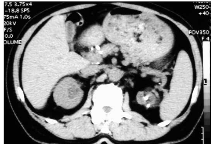
Figure 2. View of the normal right kidney and perirenal zone after conservative treatment

Conservative treatment is successful in a few cases. Huang et al. (5) performed percutaneous drainage (PCD) and used systemic antibiotics (6) reported a case which was treated by PCD.