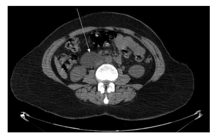
Figure 2. CT-scan of the abdomen presented a unilocular, anechoic, thin-walled cystic lesion in the right para-aortic region close to duodenum

MEN1 is a rare autosomal dominant hereditary cancer syndrome presented mostly by tumours of the parathyroids, endocrine pancreas and anterior pituitary (1). Two different forms have been described: The sporadic form presents with two of the three principal MEN1-related endocrine tumours (parathyroid adenomas, GEP tumors and pituitary tumours) within a single patient. The familial form consists of a MEN1 case with at least one first degree relative showing one of the endocrine characterising tumours. MEN1