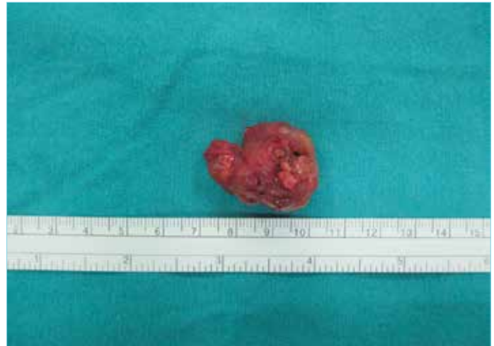
Figure 3. Macroscopic image of the excised suprahyoid mass for the case presenting with dysphagia and a mass under the chin

Embryonic development of the thyroid gland begins about 24 days after fertilization, from the endodermal diverticulum (2). Ectopic