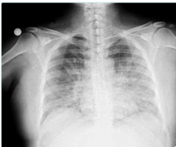
Figure 2. Image suggesting pulmonary edema in the PA chest X-ray taken at admission

inhaled beta-mimetic and inhaled steroid therapies were continued. Moreover, chest radiography performed at follow-up was normal (Figure 2, 3). In the third month of follow-up, the patient complained of ongoing cough and inhaler therapy was still being continued. In the fourth month of follow-up, the patient did not have any respiratory complaints. The results of respiratory function tests were within normal limits. Therefore, the dose of inhaler therapy was decreased, and the patient was followed-up.