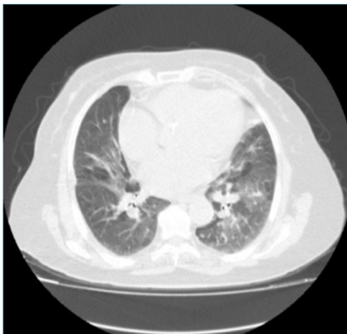
Figure 1. Icy glass appearance suggestive of pulmonary edema in the thorax CT performed after toxic inhalation