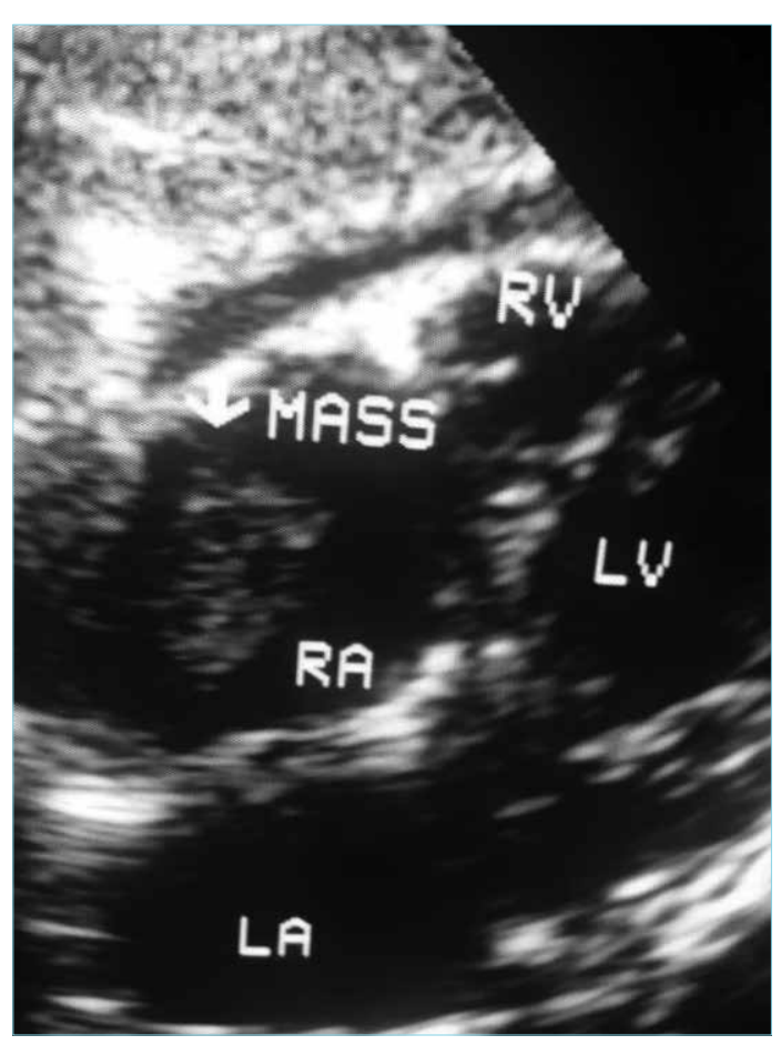
Figure 3. Echocardiography suggestive of a mass in right atrium extending from IVC likely to be a thrombus with dilated right sided chambers