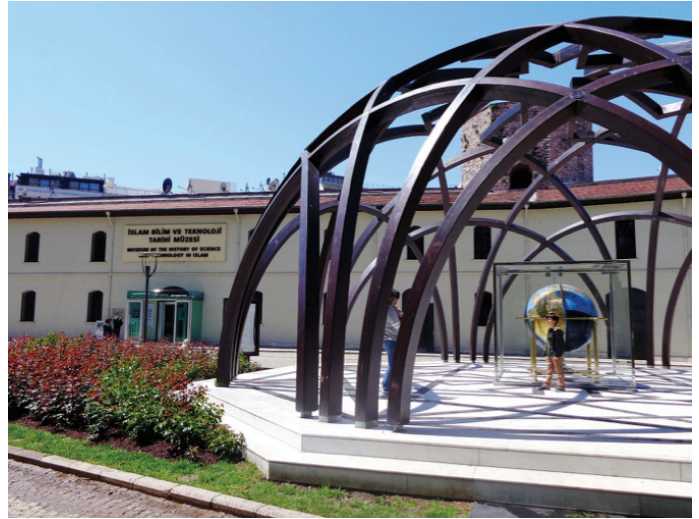
Figure 2. The Istanbul Museum of the History of Science and Technology in Islam, 2018.

He meticulously documented the scientific writings and advances achieved by Muslim savants. Among them, his voluminous GAS is of utmost importance since Arabic was, for many centuries, the language of the learned in Islamic civilizations. The third (1970) and fourth (1971) volumes of GAS cover the historical resources of Islamic medicine, pharmacy, zoology, veterinary medicine,