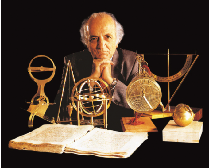
Figure 1. Prof. Dr. Fuat Sezgin at the Institute of the History of the Arab-Islamic Sciences in Frankfurt, Germany, 1990s.

and technology in the Islamic world until around 430 AH/1038 AD (2). This comprehensive work threatened to replace eminent German orientalist Carl Brockelmann's (1868–1956) Geschichte der arabischen Litteratur (History of Arabic Literature) (5).