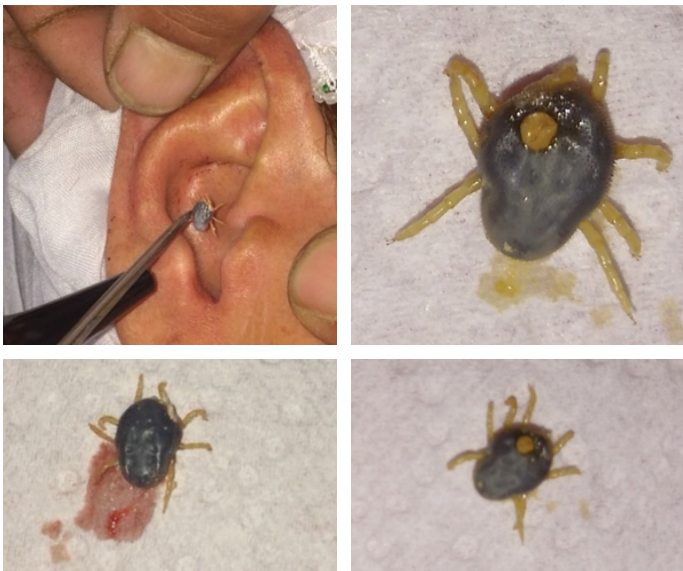
Figure 2. Removal of the ticks from the external auditory canals and macroscopic view of the ticks