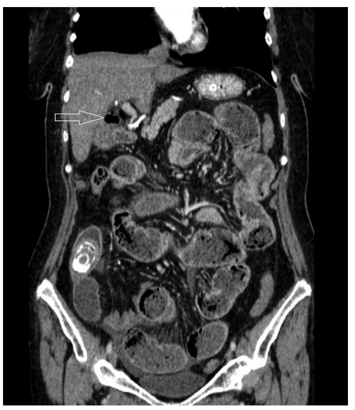
Figure 3. Computed tomography of the abdomen showed air in the gallbladder (arrow) and a gallstone localized in the distal segment of the ileum with dilatation of the proximal intestinal segments

denum. Repair of the cholecystoduodenal fistula was performed by a laparoscopic approach using the Tri-Staple Endo GIATM (30 mm), and a consequent cholecystectomy and removal of the gallstone by enterotomy with subsequent reconstruction of the terminal ileum. The patient was discharged on the 5<sup>th</sup> postoperative day due to complete resolution of symptoms and an absence of complications. Written informed consent was obtained from the patient who took part in the present study.