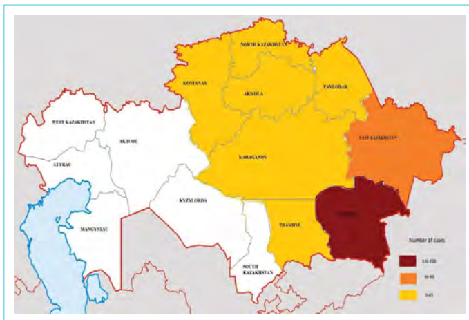
Figure 1. Distribution of tick-borne encephalitis in Republic of Kazakhstan

the Infectious Diseases clinic. Acute onset of symptoms, toxemia, meningoencephalitis syndrome, epidemiological history, inflammation in CSF, Positive ELISA test to TBEV supported a clinical diagnosis of tick-borne encephalitis with meningoencephalitis and severe form. The outcome of the disease was favorable. Patient consent was obtained for this study.