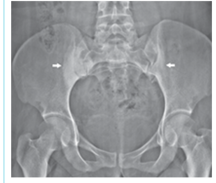
Figure 1. X- ray of the sacroiliac joints; anteriorposterior view revealing sclerosis at the iliac border of the sacroiliac ioints (arrow)

The prevalence of OCI in the general population has been reported to be 0.9%-2.5%, mostly in women during the prepartum and postpartum periods (1). OCI is often asymptomatic; however, some features of inflammatory back pain, such as the characteristic worsening at rest and morning stiffness, might be experienced (2). OCI is diagnosed based on the accurate identification of the characteristic radiographic findings (sclerotic lesions) and the exclusion of other conditions associated with back pain (infectious sacroiliitis, Paget's dis-