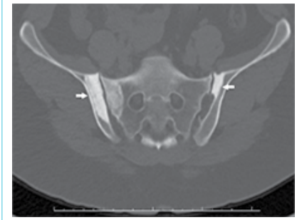
Figure 2. Axial CT image of sacroiliac joints revealing periarticular sclerosis on both sides (arrow)