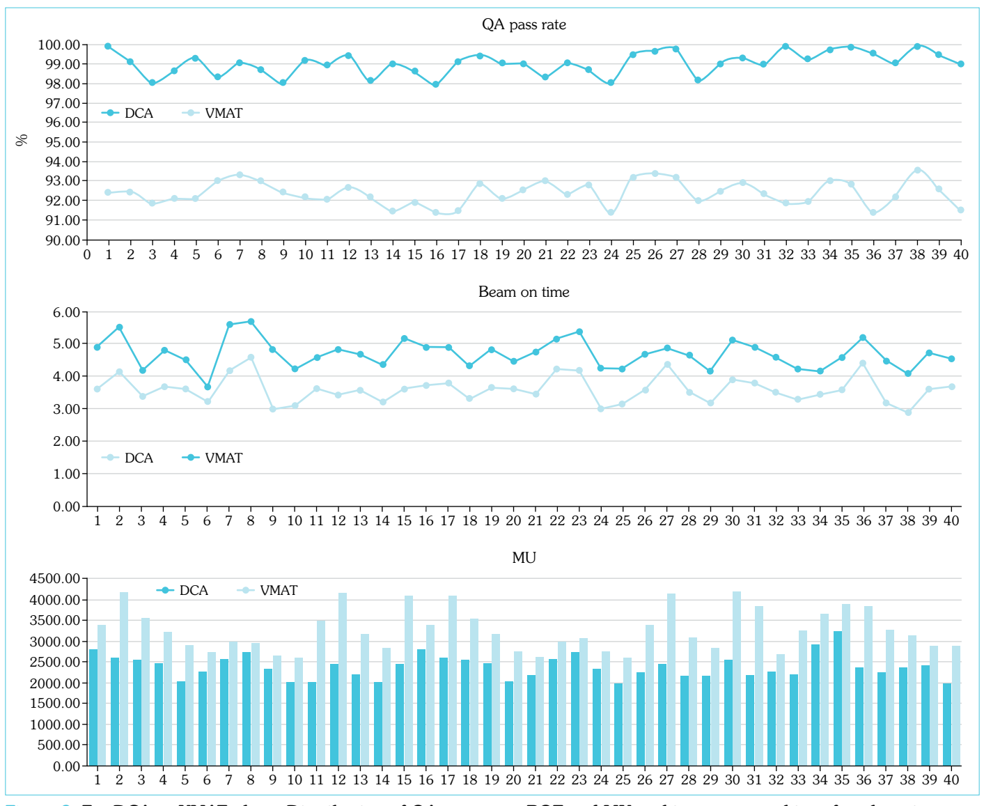
Figure 2. For DCA vs VMAT plans, Distribution of QA pass rate, BOT and MU on histogram graphics of each patient

for V<sub>5Gy</sub> were 11.2% vs. 15.5% (p<0.050). All plans of DCA and VMAT techniques were at least 95% of PTV received 95% of the prescribed dose, and values of PTV minimum (D<sub>%98</sub>; 50.13 Gy vs 49.05 Gy; p=0.610), maximum (D<sub>%2</sub> Gy; 60.14 vs 59.99 Gy; p=0.692) and mean (D<sub>mean</sub>; 55.16 Gy vs 54.19 Gy; p=0.712) were similar.